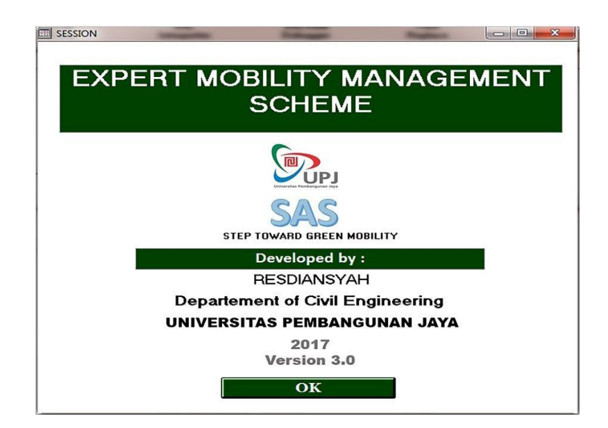
Fig. 3. General information interface.