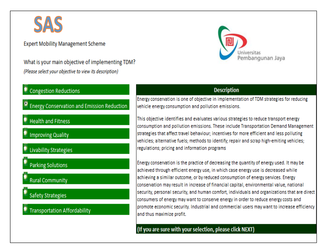
Fig. 4. Screen snapshots example of one module in SAS.