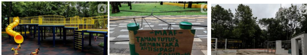
Figure 4. Puring park after Covid-19 pandemic

In the picture above there is a crowded atmosphere of visitors and traders who make use of this park. Visitors use this park to be used as a recreation place with relatives and family while traders use this park as a place to sell. In the picture, before Covid-19 pandemic, now the atmosphere in the Puring Park becomes very quiet even arguably no one uses this park at all. On the observation of researchers it is unfortunate that public spaces are not used properly, in this park should be reopened but visitors who come should be restricted and also have to adhere to health protocols that must be maintained such as wearing masks and washing hands due to the Covid-19 pandemic.