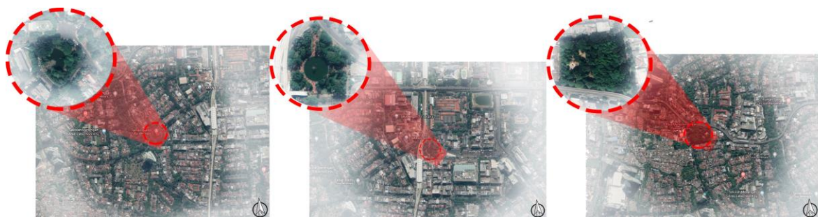
Figure 1 Research site of Martha Tiahahu Park, Ayodya Park and Puring Park

Research methodology. This research methodology answer the purposes, this research employs three different open green spaces as the case studies, which are Martha Tiahahu Park, Ayodya Park, and Puring Park, to observe how inclusiveness and accessibility were implemented and how their response to pandemic Covid-19. This research based on [1] recent issues related to pandemic Covid-19, inclusivity and accesibility on our SDGs goals and agendas, then we find [2]primary and secondary datas [3] to analyze the research questions. Otherwise, this research uses function and ownership approach to make a focus this reseach .