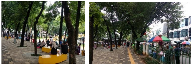
Figure 3. Puring Park before Covid-19 pandemic

In the image above is a mapping image of the new kebayoran area, which aims to see the proximity of the three parks. In the green open space located in the new kebayoran area. In this area there are many parks, but researchers only chose the three parks that would be discussed in the study. These three parks are considered important to researchers, because these three parks are very much needed once in the city, this intends to make a public space for residents living in the area.